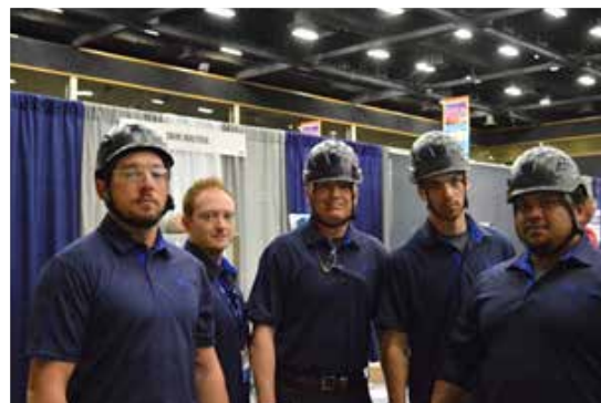
Dallas Central Snappers waiting for their next event.