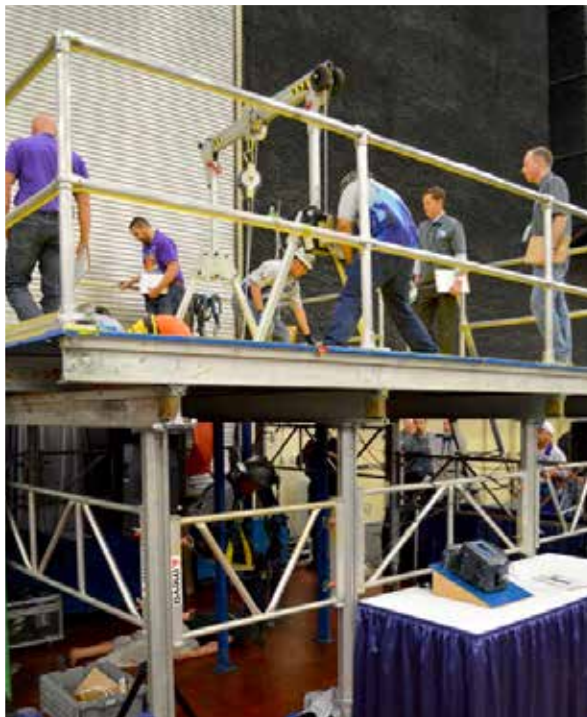
The TRA CReWSers run the Carollo Safety Event Challenge.