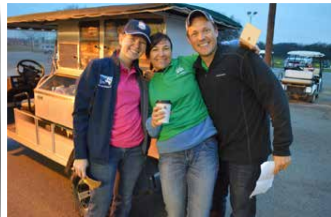
Rain or shine, snow or sleet...what a GREAT team!