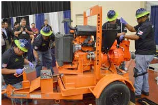
TRA Denton Waste Warriors compete in the Walter Chaing Maintenance Event.