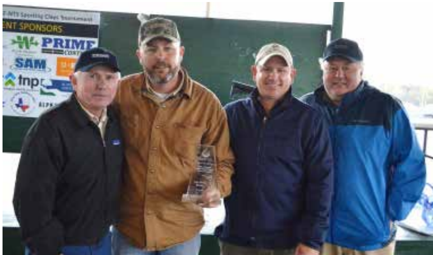
First Place Team - Prime Controls