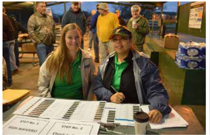
We have the BEST Volunteers!