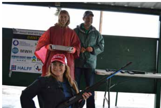
Winner Winner Chicken Dinner!