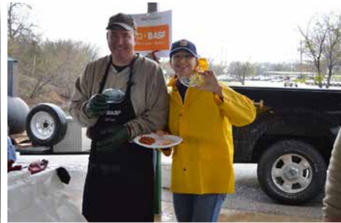
We came hungry and cleaned them out!