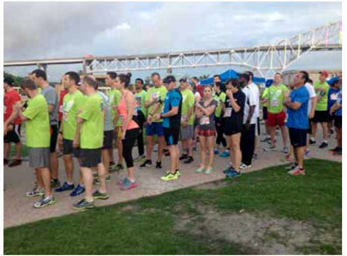
Lining up to Start the Race...

The week leading up to the race had rain and wind throughout Corpus with not the best forecast for favorable running conditions. But right on queue, the morning of the race gave us mid 60s temperatures and one of the best sunrises the Chamber of Commerce could have ordered up. As folks were making their way over to the Convention Center Circle garden start area, jockeying around the Selena festival, by Five o'clock the timing company arrived to begin set up. Volunteers and helpers were on registration