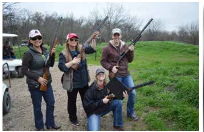
Lovely Ladies Locked and Loaded!