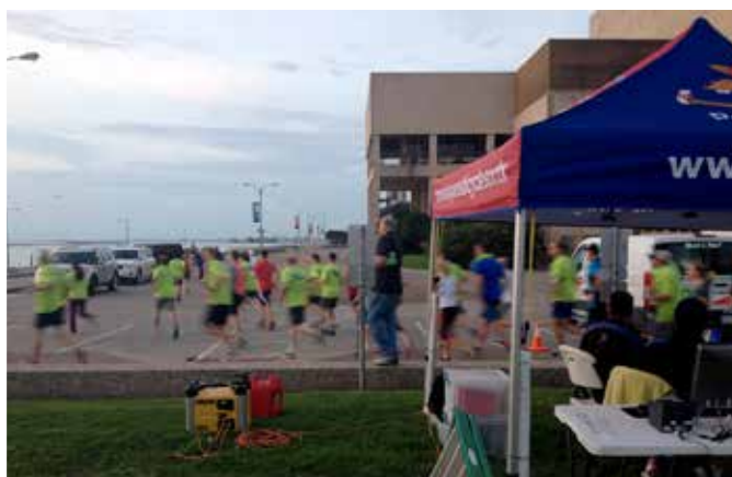
So FAST they went by in a BLUR!

Of course this event is about something much greater than enjoying some time outside and winning awards. It's about giving back. This event certainly could not be possible without the fantastic support of our corporate sponsorship and generous donations given by each of the runners and the teams they create. All of the proceeds from this event go back to the Young Professionals via the Dodson's Drive Benefit Foundation. Supporting them for scholarship assistance, continuing education, YP Summit representative and much more.