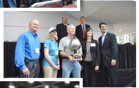
The Trinity River Authority was awarded the Utility Management Award.