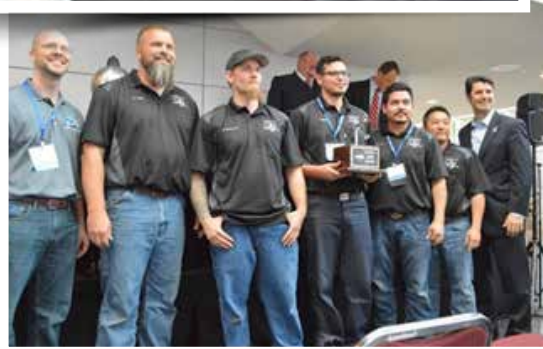
Dallas AquaTechs won 1st place in the Walter Chaing Maintenance Event.