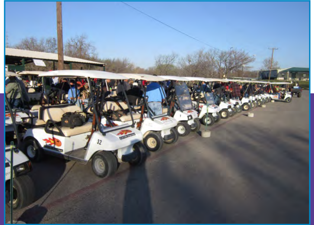
The first teams set out to begin their day of leisure drivin' around the shootin' range.