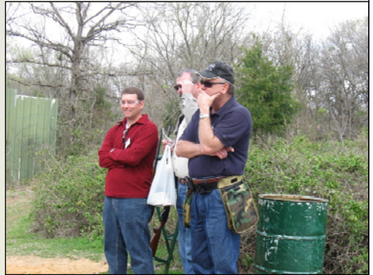
Team Wascally Wabbits from Hartwell Environmental survey the next challenging station.