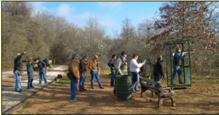
Shooters line up at the station.

Participants ranged from first-time shooters having fun to experienced shooters who were competing for the trophies. All participants enjoyed a BBQ lunch catered by Ken Moore.