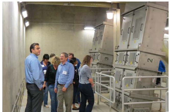
IPS Tour in Progress. Screening mezzanine level pictured.