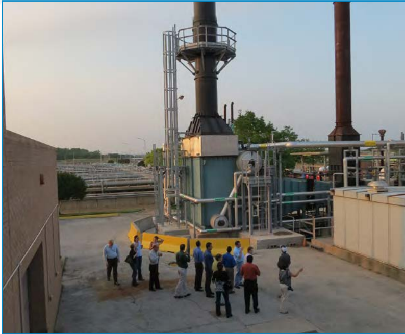
A group tours Village Creek's waste-to-energy project.