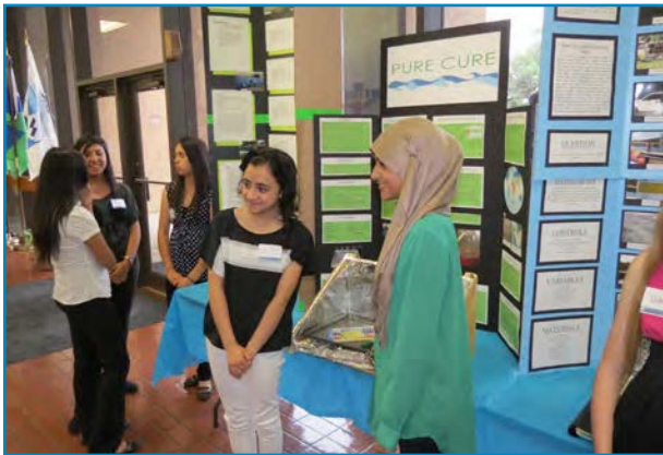
Science Fair award winners pose with their project presentations.

Quite the sumptuous dinner spread was prepared for the meeting attendees.