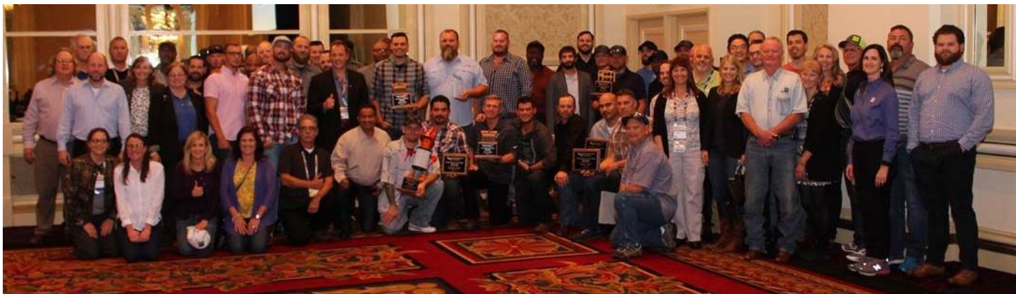
Texas WEAT delegation with all Operations Challenge Teams