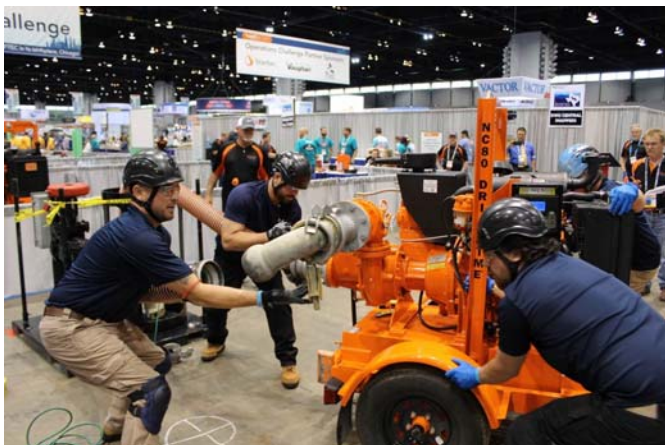
North Richland Hill PooSaidons on the Safety Event