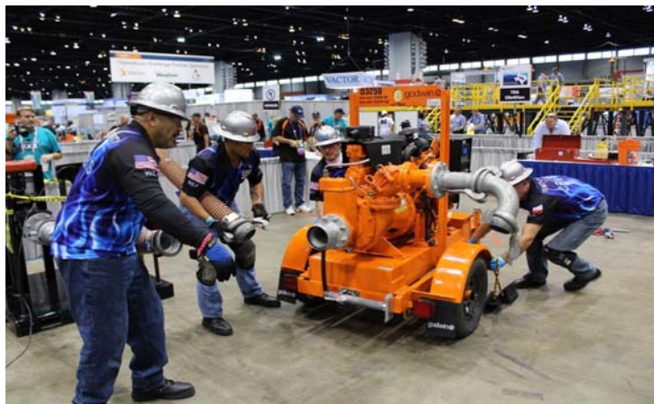
Trinity River Authority of Texas CREWSer on the Pump Maintenance Event