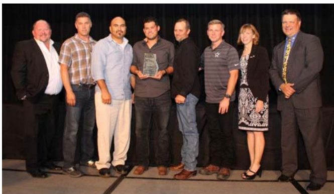
Trinity River Authority of Texas CREWSers – Division 1 First Place Overall