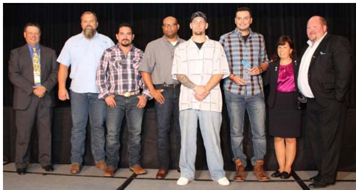
City of Dallas Aqua Techs – Division 2 First Place Overall