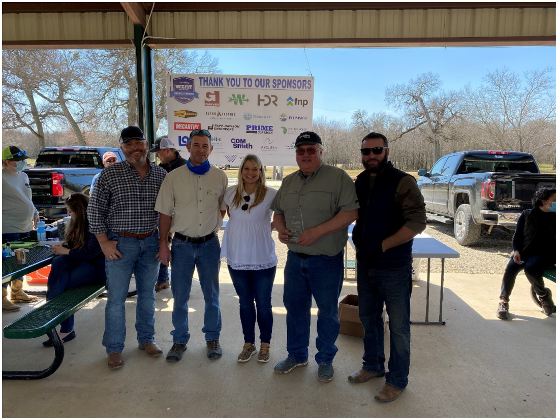
First Place Team – Prime Controls with an average team score of 99.25