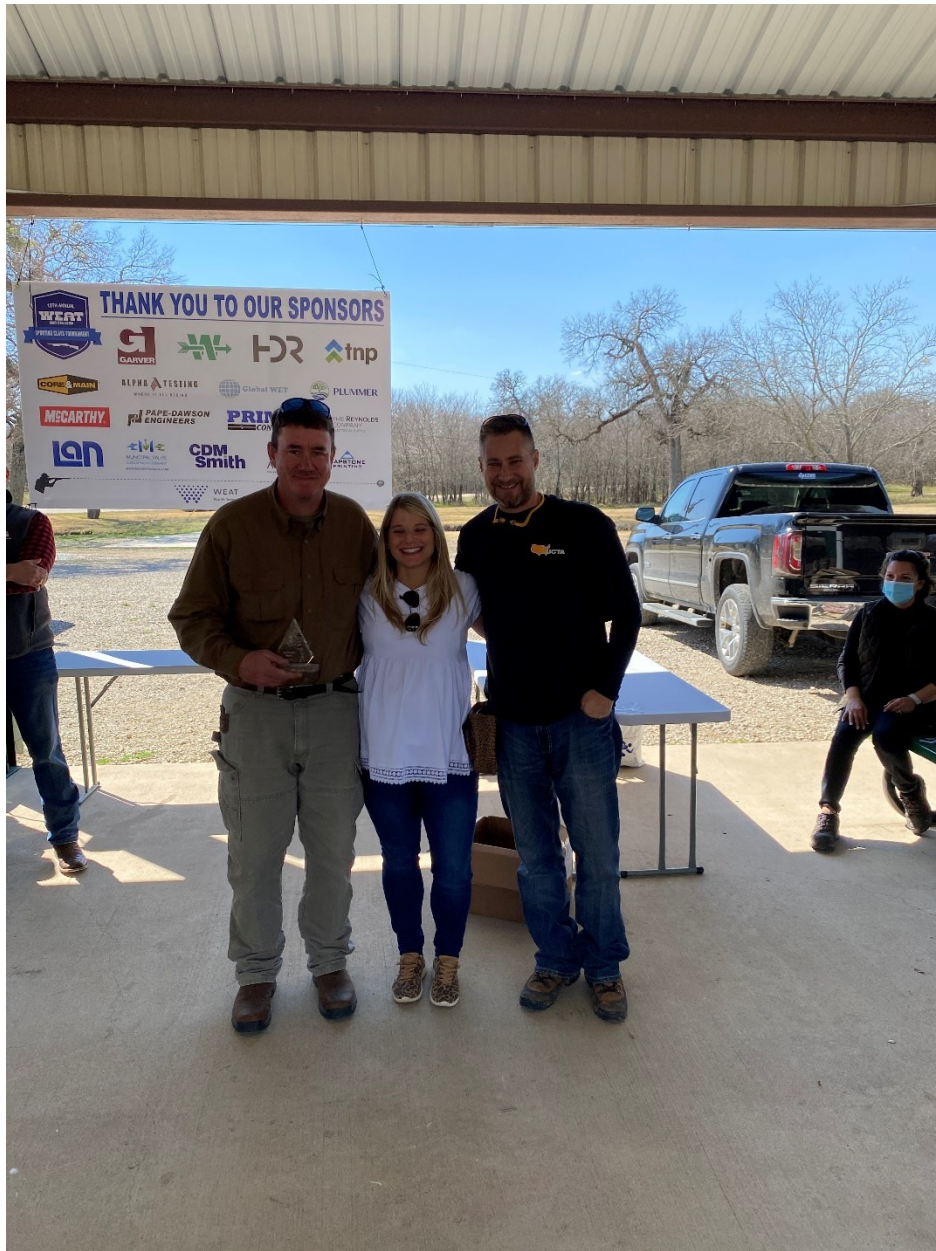
Third Place Team was BASF with an average team score of 87