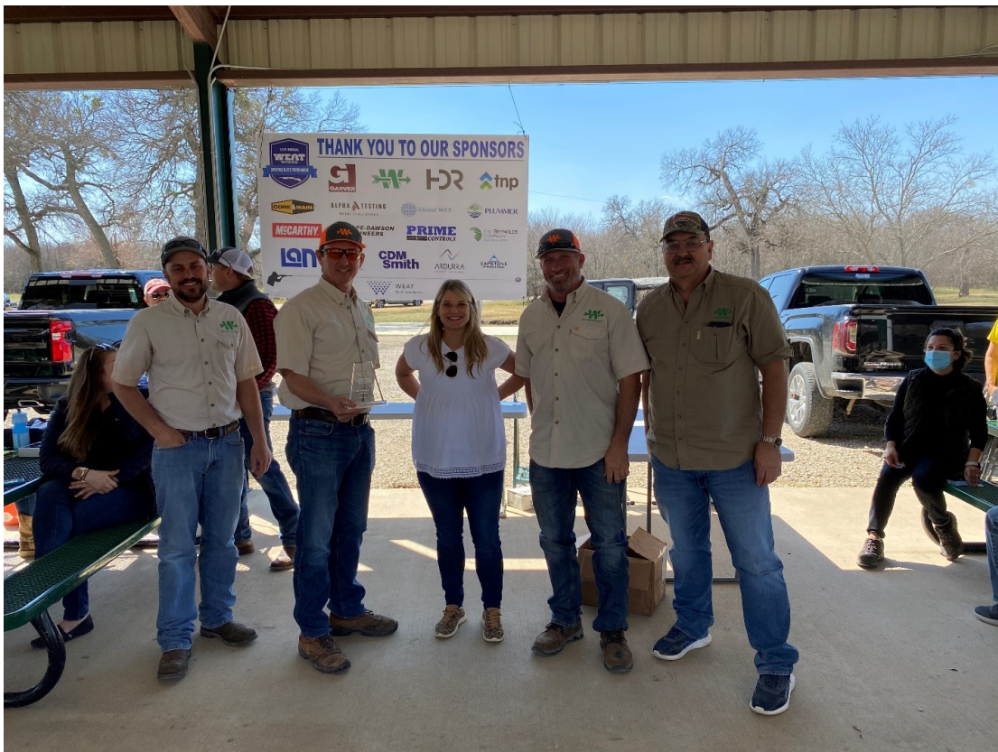
Second Place Team was Archer Western Construction #1 with an average score of 95.25