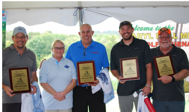
1st Place— H&H Restoration/Chesterton

Congratulations to our top three teams and thank you to everyone who supported this great cause. We raised more than $26,000 for the WEAT-NTS and Daryl Hall scholarship funds!