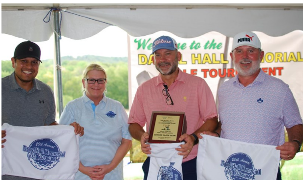
2nd Place— Gupta and Associates