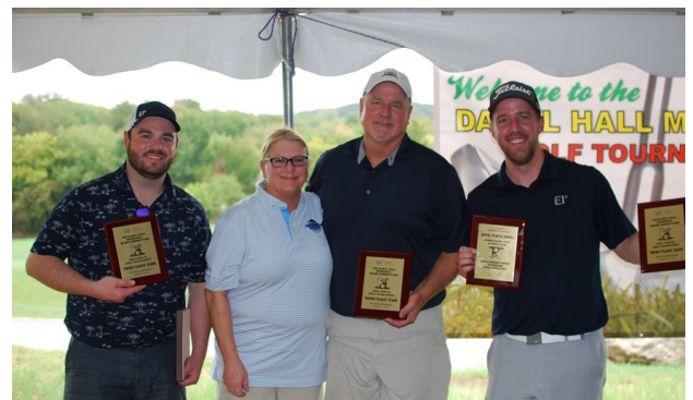
3rd Place—Environmental Improvements, Inc.